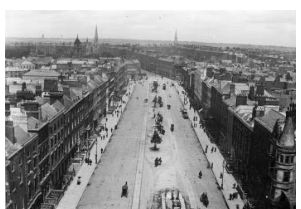
D'Connell Street, Upper, viewed rom Nelson's Pillar, c.1890

ÉIRE 1916 Clár Comórtha Céad Bliain Centenary Programme