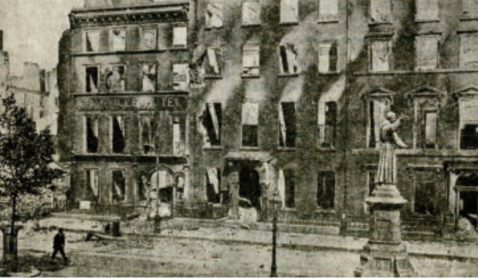
Irish Builder, 15 July 1922, p. 498

O'Connell Street, Upper, east side, July 1922