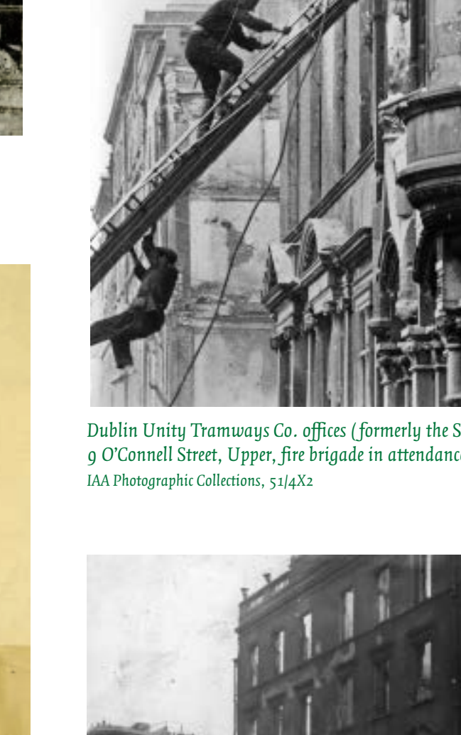
Dublin Unity Tramways Co. offices (formerly the Scottish Provincial Insurance Co.), 9 O'Connell Street, Upper, fire brigade in attendance, July 1922