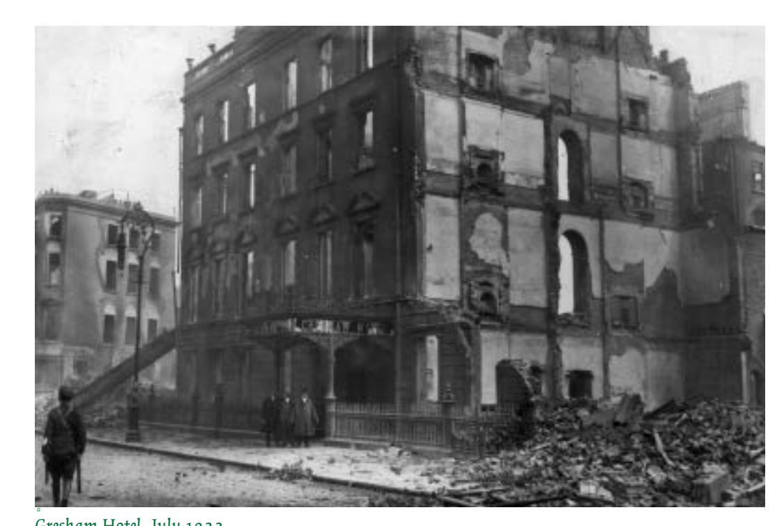
Gresham Hotel, July 1922